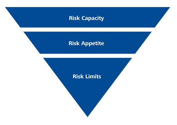
Figure 1. Hierarchical approach to risk appetite concepts

Through the use of the concepts of risk capacity, risk appetite, and risk limits, the various components of the risk appetite framework are defined. Thus, risk tolerance is not depicted as a separate concept in Figure 1. However, individual firms may choose to use their own definitions. What is most important is that the terms that are used within the risk appetite framework are clear and consistent.