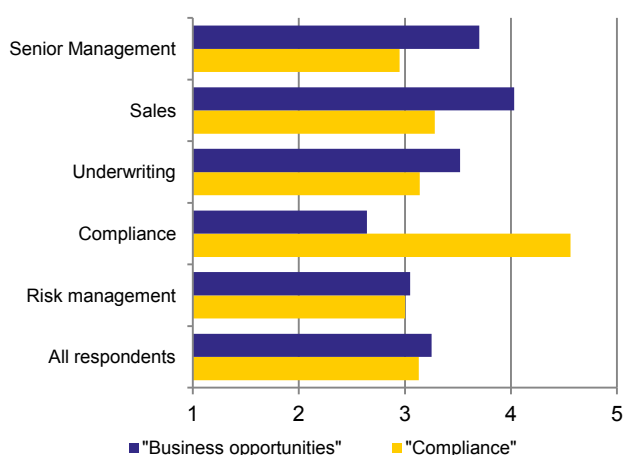
Figure 1: Working Time by Respondent Level (Percentage of working time: 1 = 0%; 7 = 90%+)