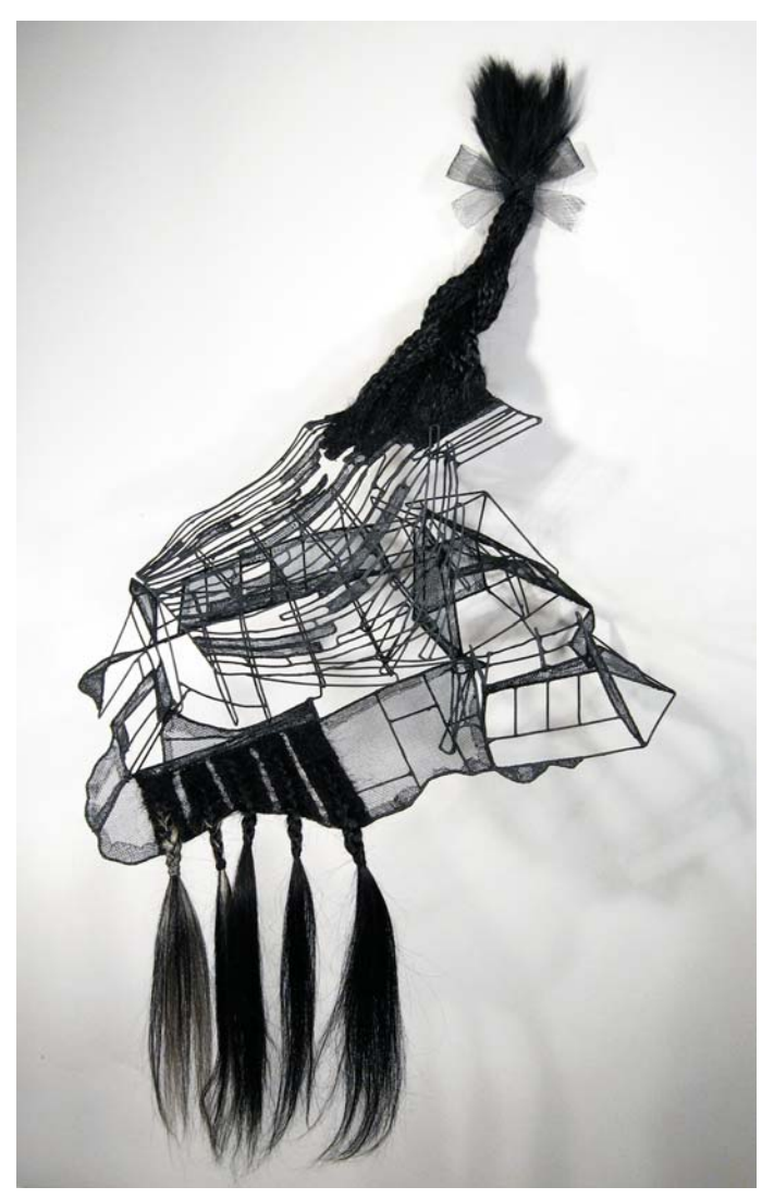
LOREN SCHWERD, Arc, Human hair, fiberglass screen, wire, 20 x 14 x 40 inches, 2008.

the years preceding the financial crisis of 2008–2009 is illustrative of such a dynamic.