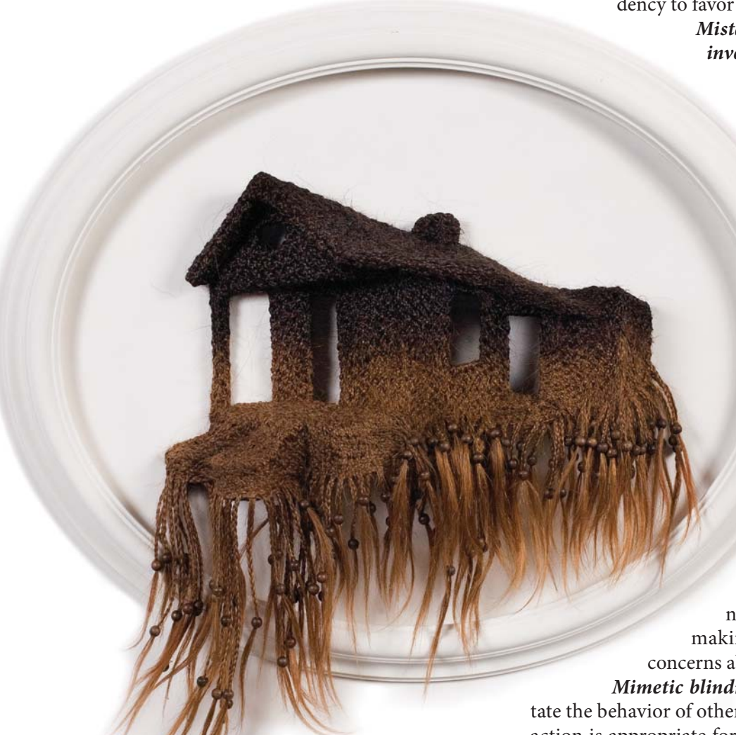
LOREN SCHWERD, 1317 Charbonnet Street, Human hair, mixed media, 19 x 23 x 3.5 inches, 2007.

In addition to these behavioral biases, there are economically rational reasons why individuals and firms in hazard-prone areas do not undertake risk-reduction measures voluntarily. Consider the hypothetical Safelee firm in an industry in which its competitors do not invest in loss-prevention measures. Safelee might understand that the investment can be justified when considering its ability to reduce the risks and consequences of a future disaster. But the firm might decide that it cannot now afford to be at a competitive disadvantage against others in the industry that do not invest in loss prevention. The behavior of many banks in